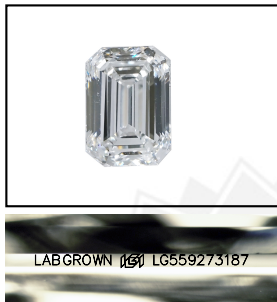
LASERSCRIBE SM Sample Images Used

Comments: As Grown - No indication of post-growth treatment. This Laboratory Grown Diamond was created by High Pressure High Temperature (HPHT) growth process. Type II