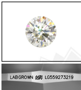
LASERSCRIBE SM Sample Images Used

Comments: As Grown - No indication of post-growth treatment. This Laboratory Grown Diamond was created by High Pressure High Temperature (HPHT) growth process. Type II