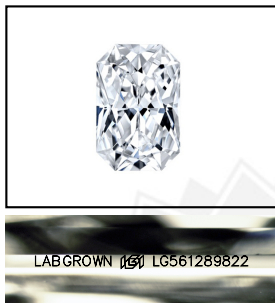
LASERSCRIBE SM Sample Images Used

Comments: As Grown - No indication of post-growth treatment. This Laboratory Grown Diamond was created by High Pressure High Temperature (HPHT) growth process. Type II